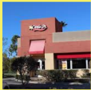
Starting Point Scraps Ranch