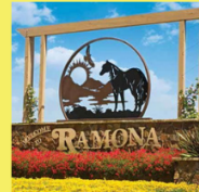
Ramona End the Day