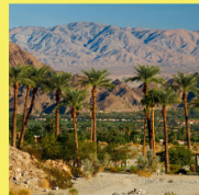
Coachella Valley Palm Desert