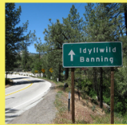
Mountains of Idyllwild